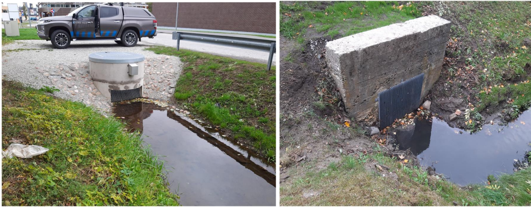
Constructed trash screens in demo sites 2 (Left) and 3 (Right)

The main challenge for the Municipality was to conduct the procurement and develop the project in such a way that it fit within the construction budget and that contractors could easily understand and implement it even in case the work scope is reduced. The Municipality's main concern was the competence of contractors because public procurement laws require that the lowest bid be accepted. We were fortunate in this case because the contractor was well-known to us, and the monitoring device subcontractor was also well-known for their expertise. The main challenge for the municipality throughout the construction phase was that we had never built anything like this before, and this was also a "first of its kind" project.