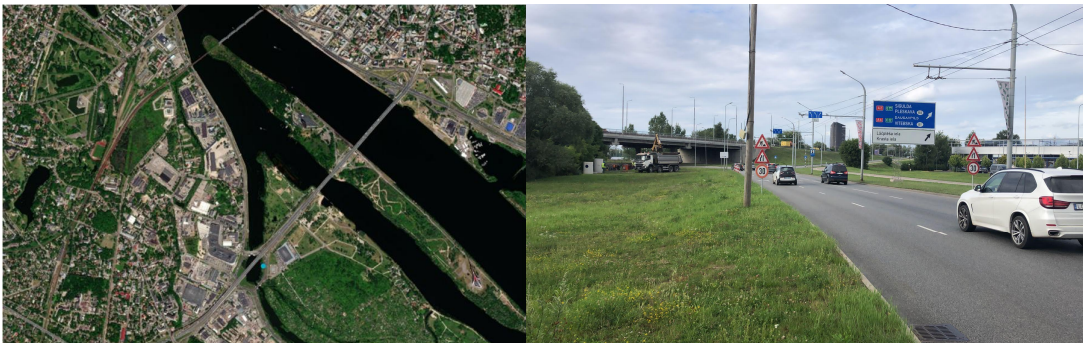
Lucavsala island (left) and selected pilot site at the bank of Dugava (right)

The pilot sites were selected in consultation with the responsible municipal departments - the Traffic Department and the Housing and Environment Department of Riga city who were also involved in the project working group. The following