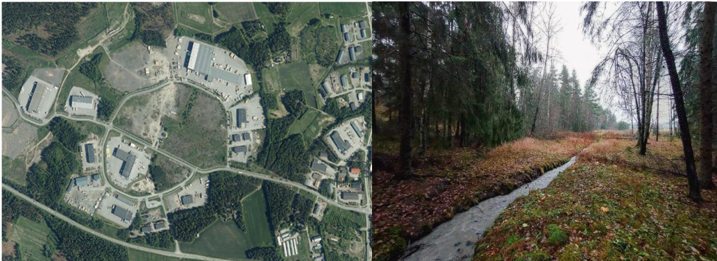
Catchment area of the Lieto pilot consists of an industrial area (left). Location of the stormwater treatment solution prior to building (right).

The following site characteristics were considered when choosing the pilot sites: