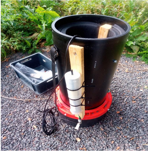
The transmission unit for pressure data is taken out from the monitoring well during maintenance at the Turku pilot site.

sensors used for flow calculations. The curve is developed from several on-site discharge measurements collected from different flow situations (low flow to flood stage).