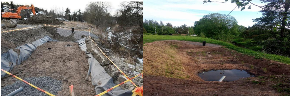
Construction of the Turku pilot site in December 2021 (top) and the ready bioretention basin in May 2022 (bottom right).