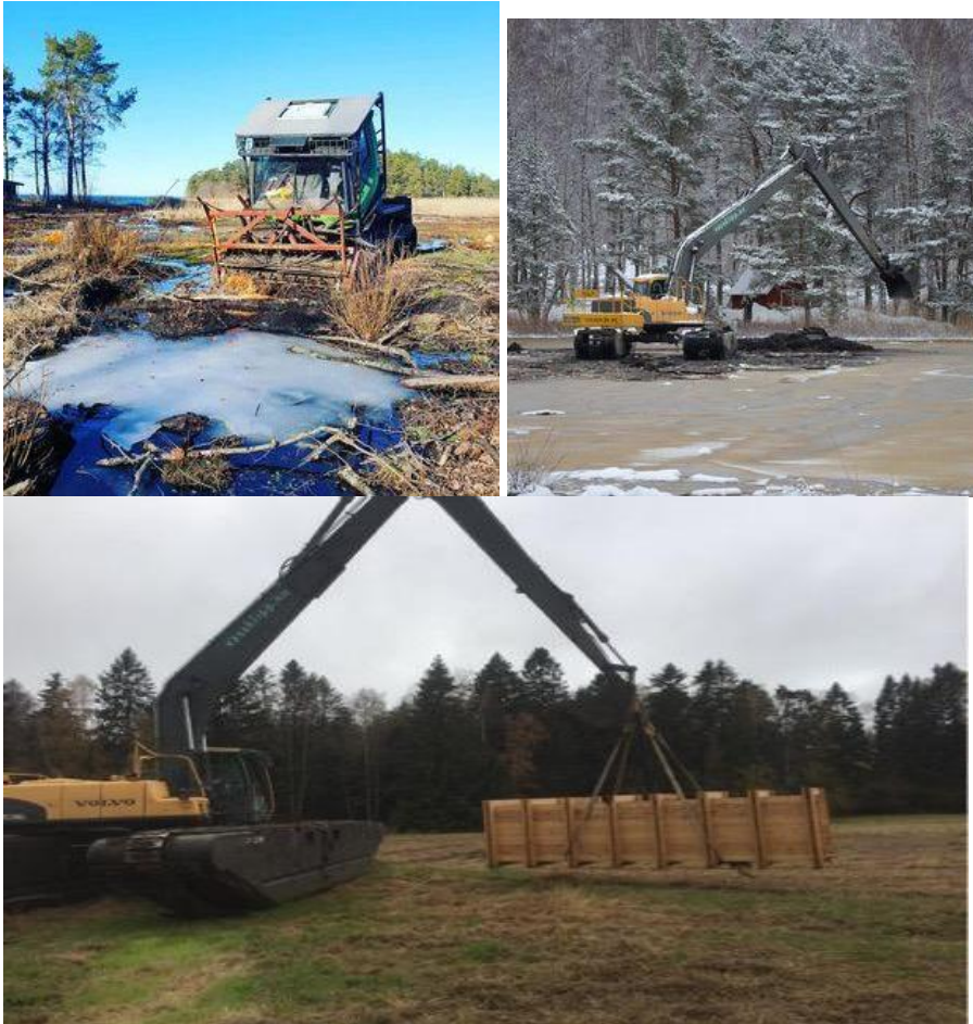
Cleaning and material transport in the area for constructing the wetland

The three wetlands on Utö have different financiers and different land and water owners. The lowest common denominator is to start with an agreement with the owners. The agreement must include the right to implement the wetland solution and to maintain the solution. A detailed survey was carried out before planning and designing the constructed wetland.