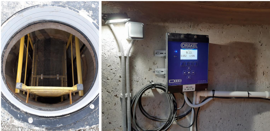
Sample measuring station at demonstration site 5

The contractor had to calibrate the devices according to the guidelines provided by the manufacturer. The accuracy of results had to be validated by an accredited laboratory.