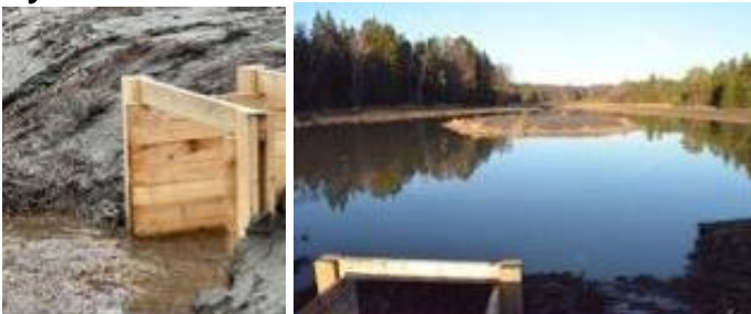
Construction of the wooden gate (left) used to regulate the water flow (right).