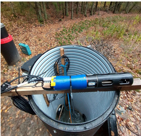
Multiparameter water quality sonde at the Lieto pilot site.