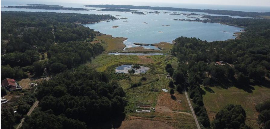
Constructed wetland site in Södra Fladen

Freshwater comes into the wetland from a 250 hectare forest area. Flowing under the main road and through a 1 km ditch passing an equestrian facility and entering the first step into the wetland, which is a phosphorus pond. Water flows into the next step where nitrogen removal processes take action. Finally, the water reaches the Baltic Sea. A survey of the land area was conducted to find a suitable place for constructing the wetland. The bottom sea area consists of gravel sands 2 meters below the surface followed by clay soil (30-40cm depth). A pond was constructed based on the vegetation and sea level.