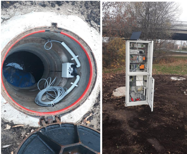
Inside of the treatment solution with sensors, switchboard and controller