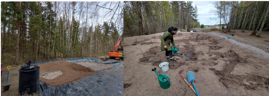
Installation of the filter medium (left) and watering of newly planted vegetation at the Lieto pilot (right).

To avoid challenges and surprises during the construction phase, thorough background research for the building site is essential. Background research should include an examination of the ground water level, the location of underground cables and pipelines in the area, and a soil quality investigation. When possible, avoid working in extreme weather conditions, such as when the temperature is well below freezing or when there is heavy rain. It is recommended to use the bypass or temporary dam if possible to ensure dry working conditions.