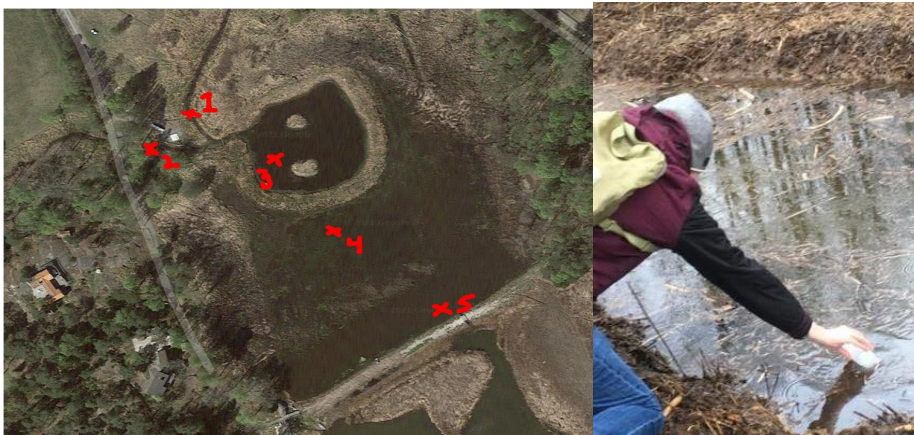
Showing sampling points and sampling in Södra Fladen constructed wetland

Stormwater quality was monitored by manually collecting samples and analyzing them for nutrients, heavy metals and polyaromatic hydrocarbons. The sampling points marked were water ditches (1,2), sedimentation pond (3), after the sedimentation pond (4) and after the wetland (5).