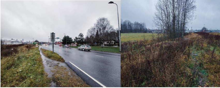
Catchment area of the Turku pilot consists of a road area (left). Location of the stormwater treatment solution prior to building (right).