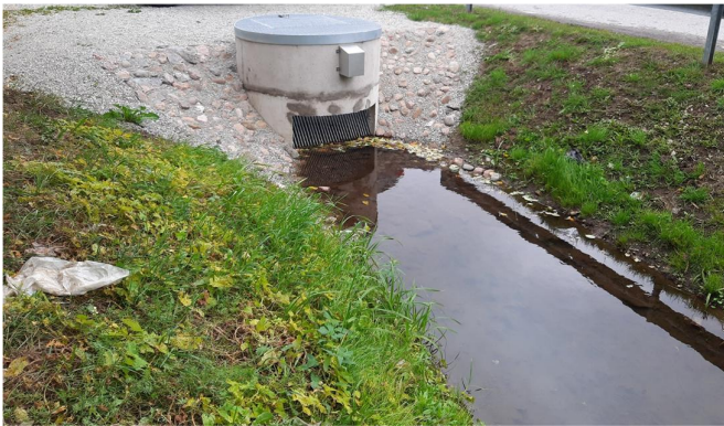
Viimsi demo site 2 – trash screen

Viimsi municipality started by looking for a catchment that is primarily urban, and would therefore be most likely to be affected by pollutants. The Municipality anticipated that human activities like transportation would cause urban watersheds to be the most polluted. The large watershed in the center of Viimsi was later determined to be the best candidate for the stormwater treatment system construction. The analysis of the watershed area revealed that there are roughly three sub-catchments, each of which has distinct treatment requirements. The first sub-watershed was found to have an issue with nutrients, the second was found to have a problem with trash, and the third was found to pose risk to the water quality due to the potential future development. In Viimsi, the entire catchment area had been granted an environmental permit, which regulates the discharge of stormwater to the Baltic Sea. This permit also mandates the municipality to collect stormwater samples to collect at the discharge point by the sea every three months in order to track stormwater quality.