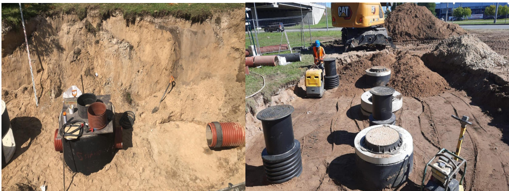
Construction site where the vertical hydrodynamic separator is installed

Until now, sensor manufacturers' platforms have been used in Riga to display various types of sensor data. Along with the Clean StormWater project in Riga, the creation of a unified data platform will be launched. The municipal ICT services provider - Riga Municipal Agency "Riga Digital Agency" plans to synchronize the development of the platform with the e-monitoring platform developed in the project.